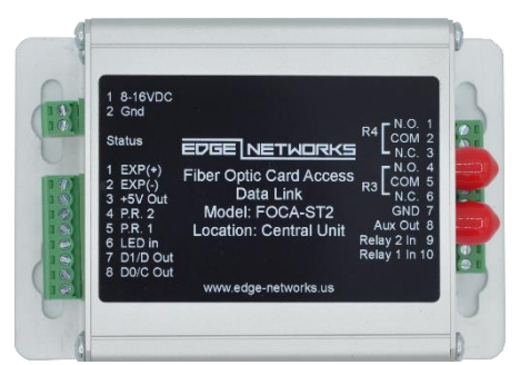
FOCA-ST2 - Central Unit