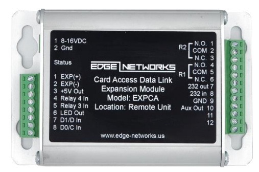
EXPCA - Remote Unit