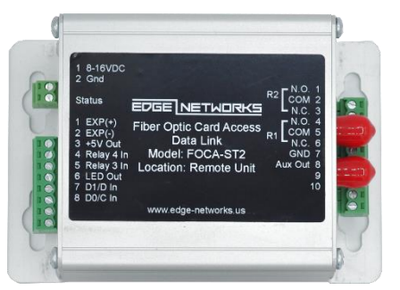
FOCA-ST2 - Remote Unit