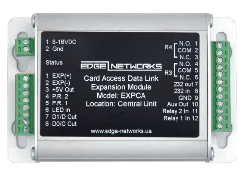
EXPCA - Central Unit